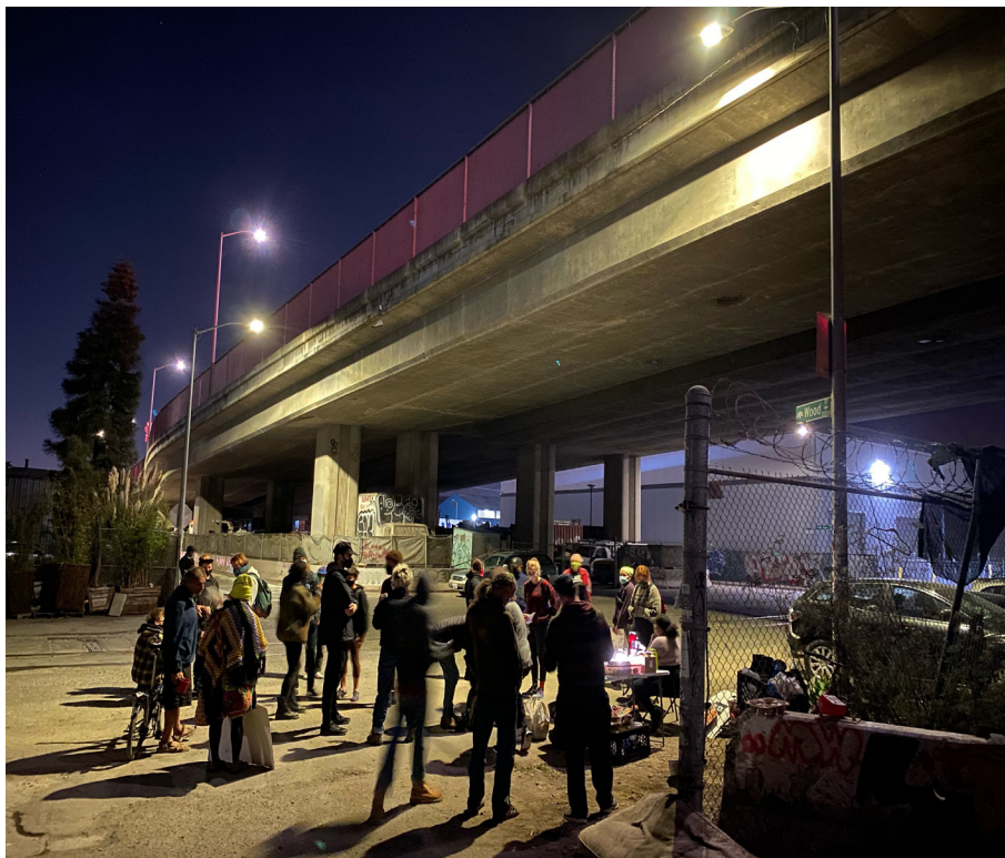
Dozens of activists begin to gather at West Grand and Wood at around 5am to provide support in the ongoing eviction defenses at Wood St.

The most important entry point to watch or guard is located at Wood & West Grand. The gate to enter the Game Changer lot by car would be here, but the lot extends past 24th St where folks could enter through holes in the fences on foot. Midday on Tuesday, three cop cars approached the opening at Wood & West Grand – folks on watch were able to form a barricade using shields and prevented their entry. Since Tuesday, we have had at least 2-4 folks watching the main gate from 5:30 AM to 4:00 PM. The fight has only just begun, and it is only a matter of time until another notice is served, or the sheriffs show up without any warning, as they always do. A sizeable rapid response team are now linked into this struggle and will be notified if and when a raid begins.