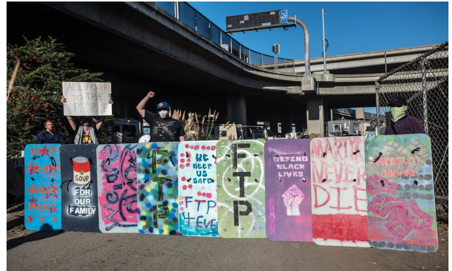
Activists form a shield blockade to at a recent eviction defense at Wood St to prevent police from entering the Game Changer lot.

UFAD members have been in conversation with several Wood st residents about the eviction notices and we urge everyone else who works independently to continue to build longstanding relationships with the residents we meet during shifts guarding the gate. It is up to all of us to use this information and personal experiences as a catalyst to inform fellow comrades and residents of this past weeks' events. Wood st residents must be brought up to speed, as well as housed comrades who choose to show up and resist these evictions.