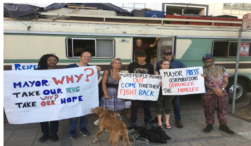
Photo of Wood st residents and UFAD members from an eviction defense in 2018. Residents and activists have been resisting evictions on Wood St for years.

Activists and residents of the area came together to form the United Front Against Displacement in October 2018 as a new surge in intense evictions and sweeps began to happen in the neighborhood. That month the city of Oakland towed over 15 RVs and trailers in a single morning, leaving almost 40 people with nothing. These people had been staying on Wood st and as the police had pushed more people into the area, local businesses demanded that the cops clear people out and make sure they couldn't come back. These businesses even went so far as to move massive logs into the street to limit people's ability to park. Obstructing a street is normally illegal, unless it is in the interests of big business. Less than a month later, the City of Oakland sent about 6 cops to clear out the lot of Wood st. This was the first attempt by Fred Craves to clear out the lot. Fortunately, residents and activists were prepared, formed a picket line and turned the police away!